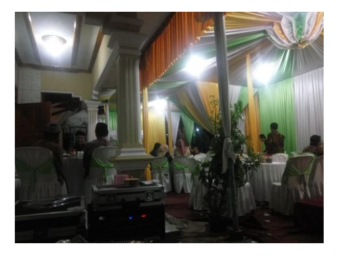
Fig 1. Celebration Situation

A celebration held at the front of the house, visible tents mounted on top with decorative shades of yellow, green and white. First entering the place of the researcher observing female guests carrying lawu medang or hantaran in a cloth-covered basin, they approached the reception desk to hand over the delivery to the committee or the family who were given the assignment as recipients of the delivery, then their names were recorded on the note.