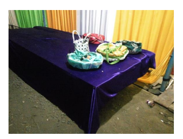
Fig 2. Table to put lawu medang

During the course of a look, they are sitting at the round table to interact with each other about 10-15 minutes the guests stand by at the celebration event. When they were about to go home the guests greeted the groom first and for the male guest while giving an envelope filled with money. It was seen from the observations of researchers on the outside of the tent there was a table to put the basin brought by female guests and had been given a name (see picture 2). Then the guests take their respective basin which has been filled with a return in the form of white rice and vegetable noodles one portion. From the information obtained by researchers that the lawu medang brought by inviting guests was presented again by the host to the kondangan guest..