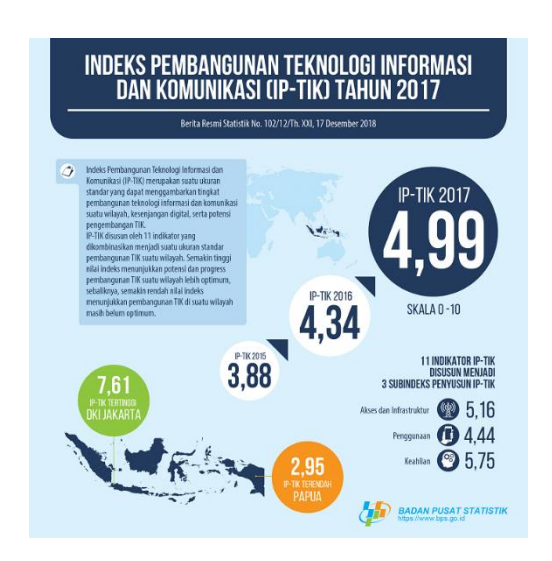
Figure 1.1 IP-TIK (Indeks Pembangunan Teknologi Informasi dan Komunikasi) tahun 2017