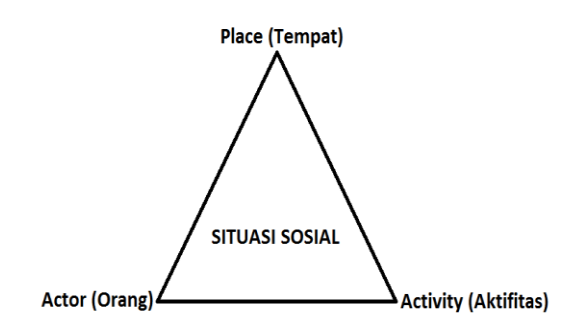
Figure 1.5 Social Situation

Apart from taking techniques, there are social situations that must be explained in qualitative research. Social situations help understand how to understand subjects, objects, and activities in research. This process determines the population and samples taken in the study. It will explained in Figure 1.5 Social Situation in Qualitative Research